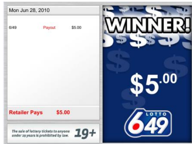
Player Display Unit

All peripherals stay ON when ‘Lock Terminal’ button is used.