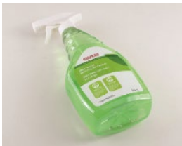
Staples Multi-Purpose Cleaner