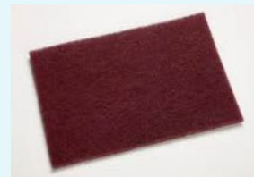
Scotch-Brite Cleaning Pad