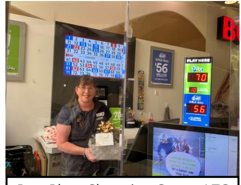
Port Place Shopping Centre LTC