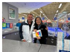
Walmart #3651 LTC