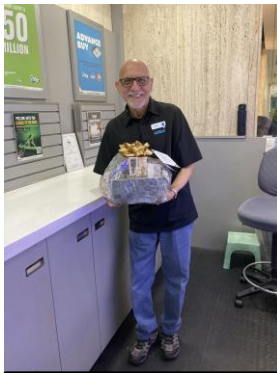
Royal Centre LTC