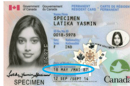
Permanent Residence Card