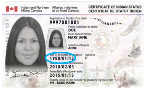
Certificate of Indian Status