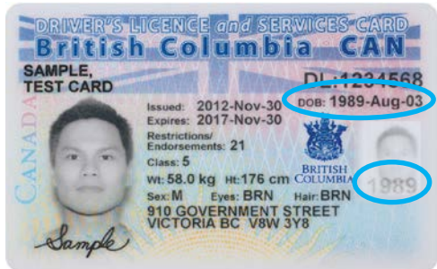
BC Driver's Licence