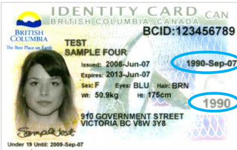
BC Identity Card