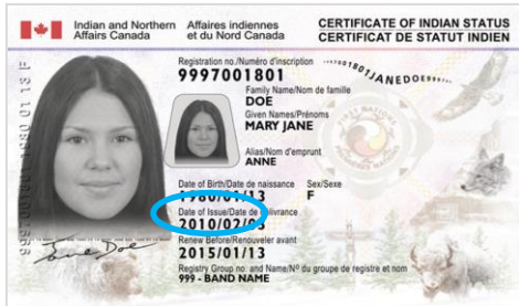
Certificate of Indian Status

Annotation indicates cardholder was a minor when card was issued.