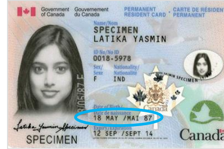
Permanent Residence Card