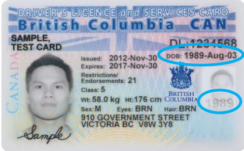
BC Driver's LicenCe